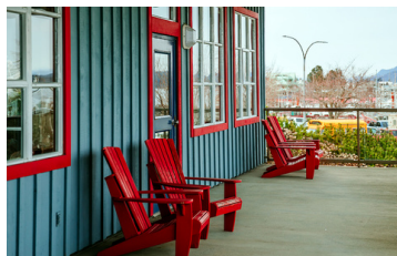
CUSTOM SET UP