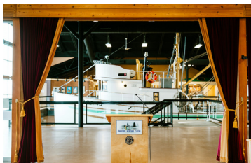
THEATRE STYLE UP TO 180 PEOPLE